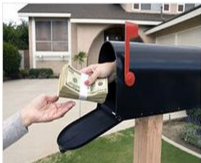
Flood Your Mailbox with ORDERS

Send a copy of your circular(s), this Circular and CASH payment